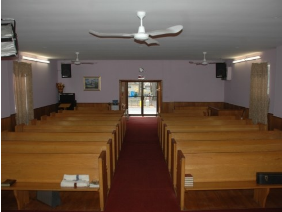
Sanctuary facing congregation