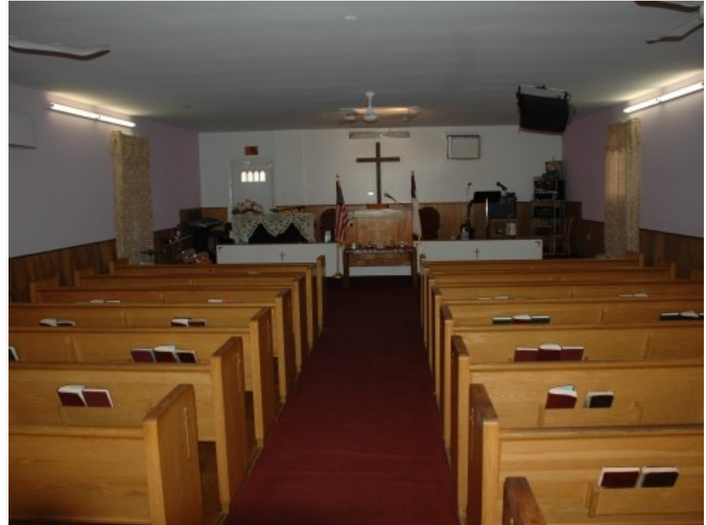
Sanctuary with view to altar