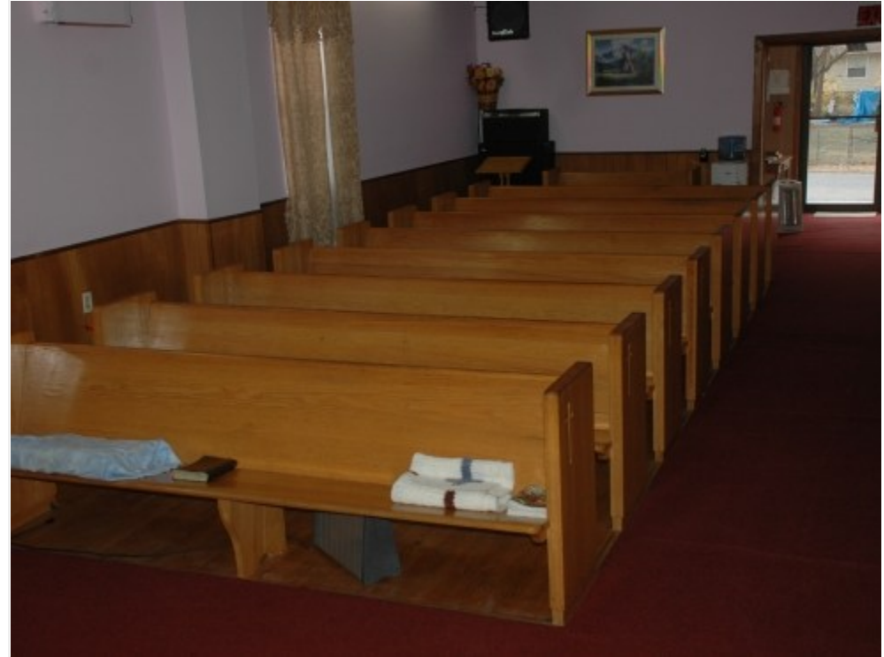
Sanctuary side view