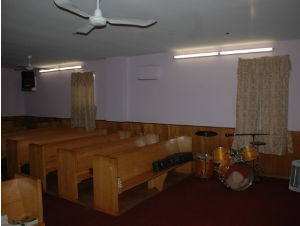
Sanctuary alternate side